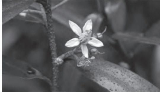
Magnification \times 1

It had been found in only one site in the wild and this site was burnt to a depth of over one metre. This destroyed seeds that were in the soil.