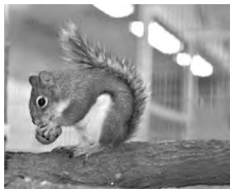
Mount Graham squirrel

In 2011 its habitat was threatened by wildfires. Two males and two females were taken from the wild by conservation workers from Phoenix Zoo.