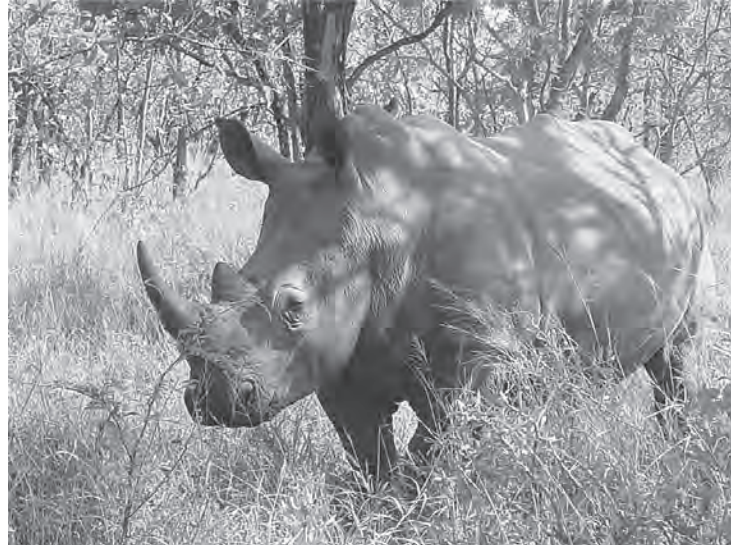
White rhino Magnification \times 0.02

The white rhinoceros, Ceratotherium simum , is an example of a mammal that is threatened with extinction.